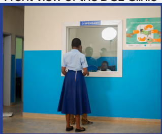
Patients receiving drugs