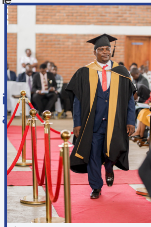
Graduands walking on the red carpet