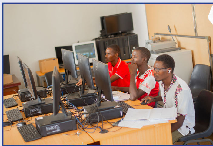
Students accessing computers in the Special Needs Unit