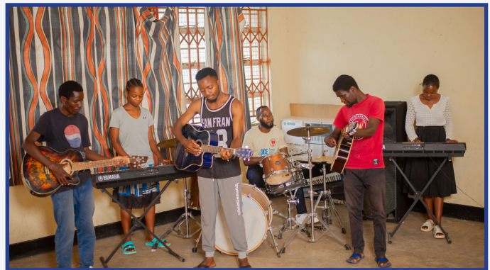
Music class working on their assignment