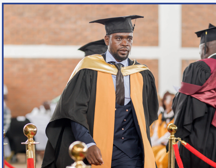
Graduands receiving their awards