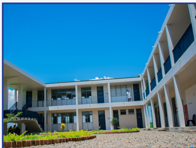
The Laboratory complex