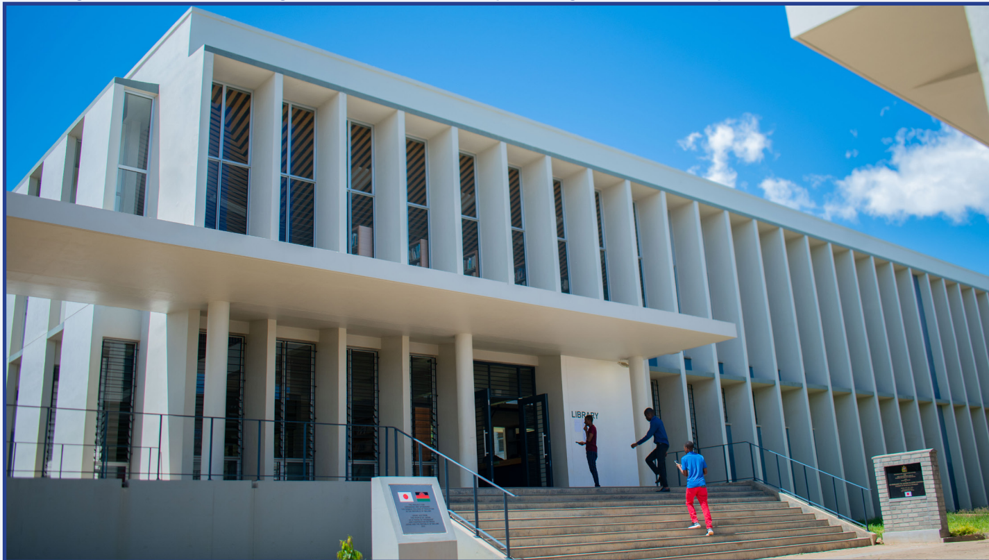
Front view of the library

DCE has a magnificent 2-storey library that is specifically designed to support teaching, learning and research. The library is demarcated into sections that provide a variety of services such as lending of library materials, provision of reading space, print and electronic reference services. The library has a large sitting capacity of 500 at a go. The library also has a section for community learning where students organise themselves depending on their study needs.