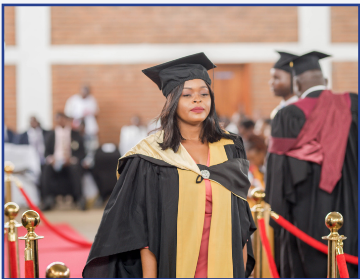
Graduands receiving their awards

Domasi College of Education is renowned in Malawi and beyond for its academic excellence and provision of diverse quality teachers who play essential roles in the provision of secondary education. Our graduates make positive contributions in all sectors of the Malawi's economy as scientists, managers, administrators, teachers, politicians, and many more as no one can become these without a teacher.