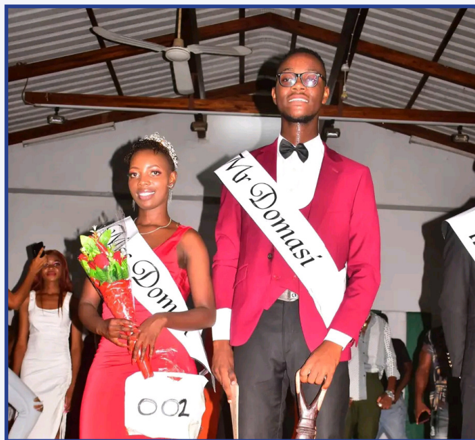
Mr. and Miss. DCE posing after winning a beauty pageant

Any discussion of the social life of students would be incomplete without mention of the Social Weekends that take place at the College. These are weekends when the student body comes together to have fun, engaging in discos, competitions and sports – an entire medley of enjoyment, as a way of relaxing from their grueling studies.