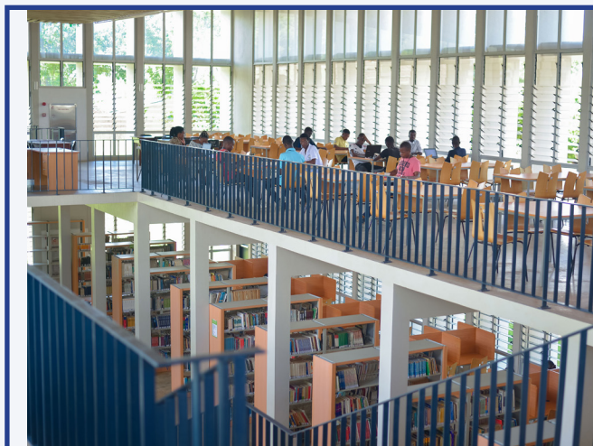
Inside the 2-storey library