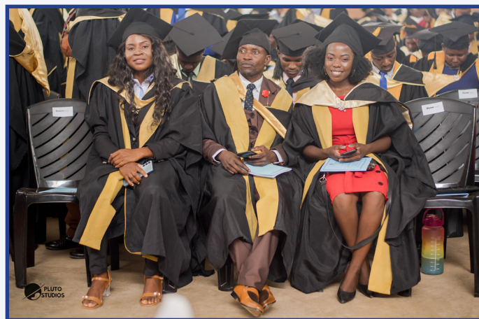
Graduands celebrating their milestone

During this ceremony, there is a unique attire that is donned by the graduand, which sets him or her off from the rest of the attendees. The graduand dons a gown, whose colours normally indicate the programme that they have completed. The next key item of clothing is the mortarboard, a unique piece of headgear that has been associated with graduations, and with scholarship, across the world. The last key item is the hood, which is draped around the neck of the scholar. In this gear, on graduation day, DCE graduate is a sight to behold.