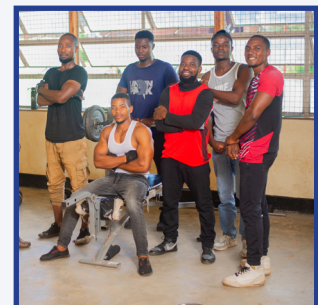
Students working out in the Gym