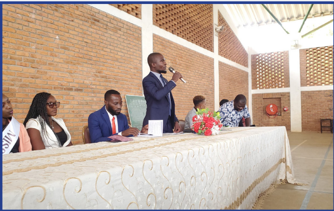
Students Representative Council (SRC) President delivering speech during orientation of first year students

DCE realises that coming to College can be stressful. We would therefore like you to join us to learn, relax and enjoy as you achieve your potential during your studies. You may not need any of the student support services we offer but it will still be helpful to you to simply know that they exist.