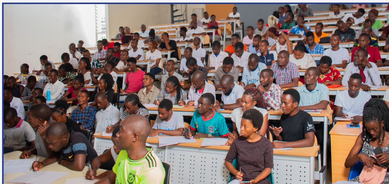
Students learning in one of the lecture halls.