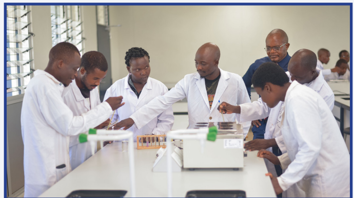
Students conducting an experiment in the laboratory