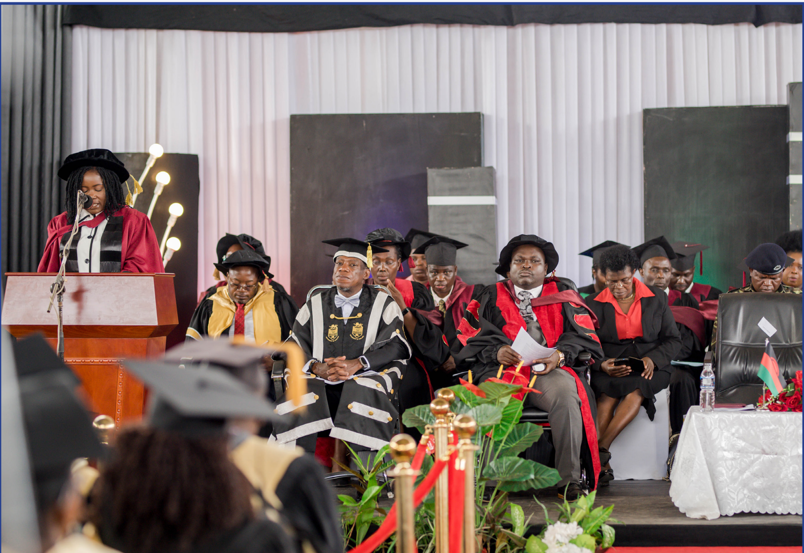
Part of DCE Top Management

The Malawi Institute of Education (MIE) involves DCE staff in its curriculum development activities. Staff from the Institute are also engaged in part-time lecturing. MIE provides the College with books through inter-library loan system.