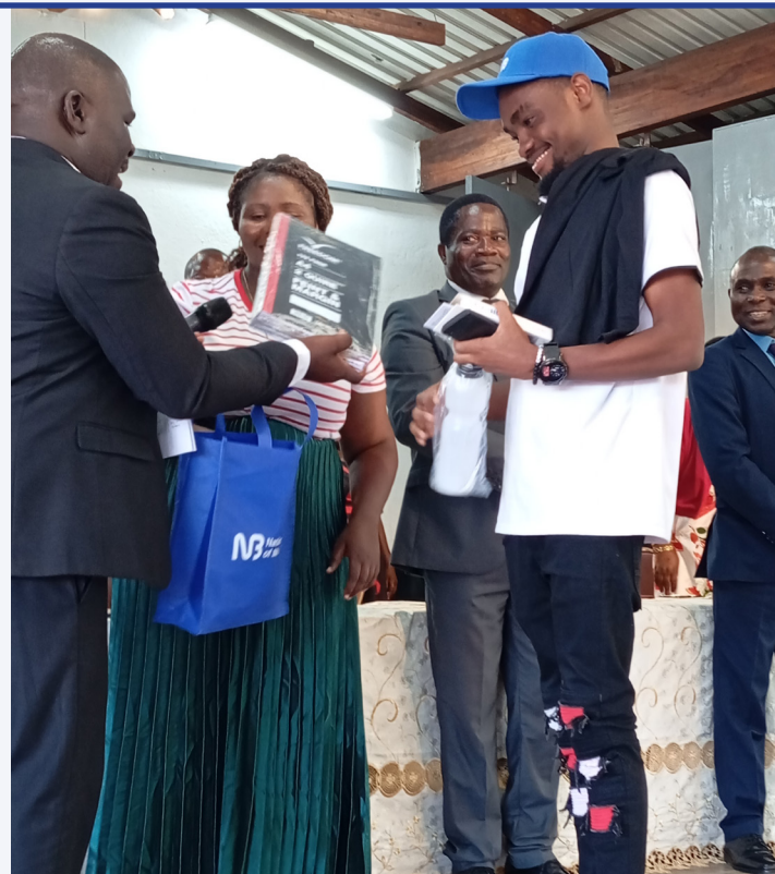
A student receiving an award from the Dean of Students