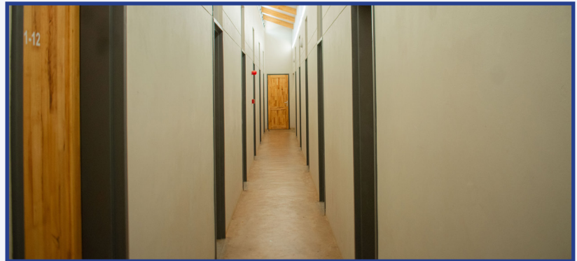
inside the hostel