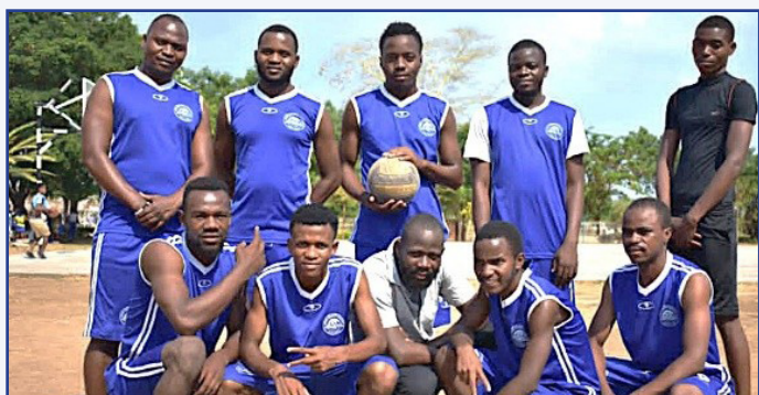
Volleyball team posing before a match

As part of social life, students are free to join any of the many clubs and societies that exist on campus, registered with the office of the Dean of Students. The nature of these clubs differs. Some are faith based, others focus on wildlife and the environment, and others focus on charity, among other concerns. Joining these clubs and societies can be a way of occasionally diverting one's focus from the academic life.