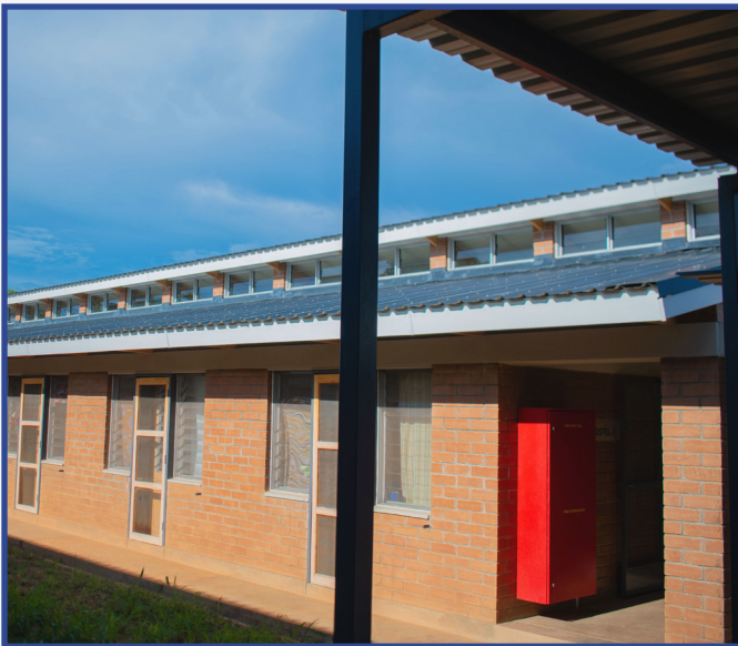
outside the Female Hostels

You will be required to pay a rental fee per month, per occupant, for the twin room as an undergraduate student. The accommodation fees are revised from time to time by management.