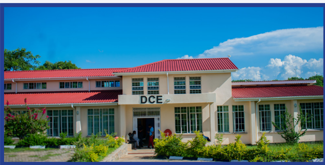
Front view of the DCE Clinic