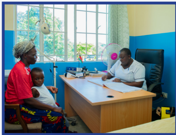
Patients receiving treatment

College has well qualified medical personnel. By virtue of being a student at DCE, you are allowed access to medical services at the clinic at a fee of K10, 000.00 per academic year.