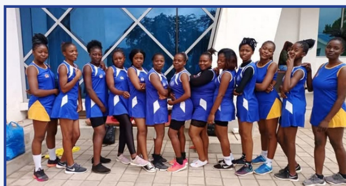
Netball team posing before a match