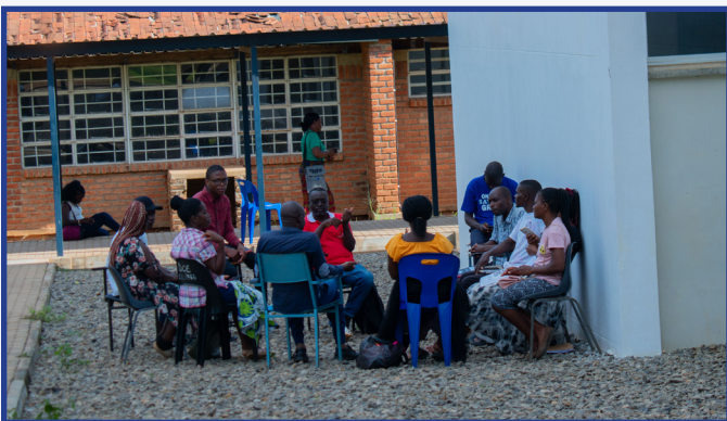
Languages students engaged in a group discussion