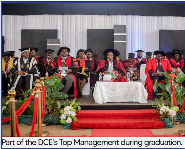
Part of the DCE's Top Management during graduation.

Meetings are held at least twice a year.