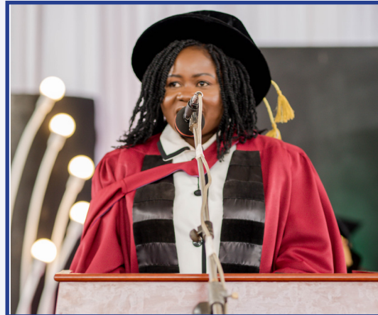
Deputy minister of Education during graduation

The second is the Academic Committee which oversees the curriculum offered at DCE and is also responsible for monitoring the professional and academic standards of the College. In particular, it approves syllabi, academic appointments and examination results. The Committee is chaired, ex-officio by the Executive Dean of School of Education from the University of Malawi and the Vice Chairperson is the Director of Higher Education. The membership comprises the Principal, Deputy Principal and Registrar of DCE, Executive Deans and Heads of Departments of both DCE and relevant departments from University of Malawi, and Senior Assistant Registrar Academic from University of Malawi.