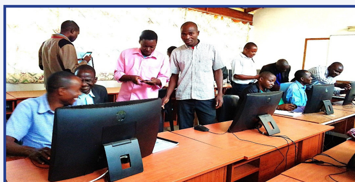
Students accessing the internet in the computer lab

In addition to the Wi-Fi, students are free to use any of the computer laboratories available on the campus. These laboratories have desktop computers that are accessible by all students. Apart from conducting research on the internet, the computers can be used for processing word documents.