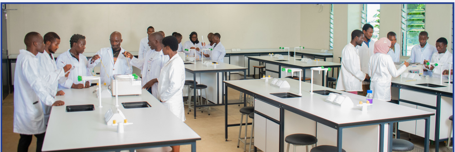
Groups of students learning in the laboratory