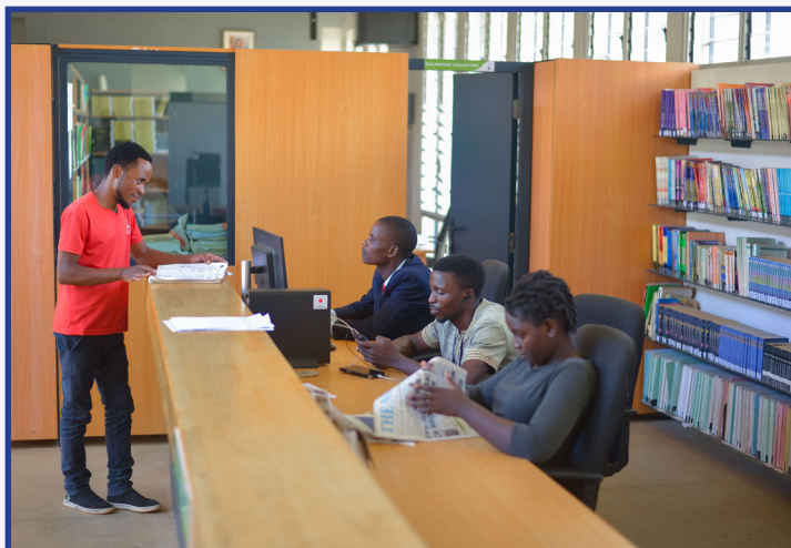
One of the students being assisted by the librarians