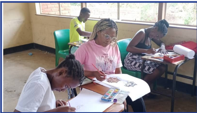
Creative Arts students

Our programmes involve teaching by practicing professionals. This is a way of preparing students for effective translating of theory into practice. You will be involved in school experience during the early years of your studies. You will then engage in peer teaching as well as micro teaching. After four year of learning theory, you will be required to conduct teaching practice in secondary schools for a period of one term. Such practices will prepare you for effective teaching and learning when you finally finish your course and join secondary schools.