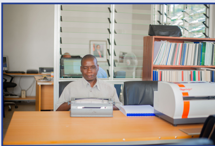
One of the students in the Special Needs Unit

The section has also wheel chairs for students with challenges in mobility. The section employs dedicated technical staff and student attendants to facilitate student learning and welfare.