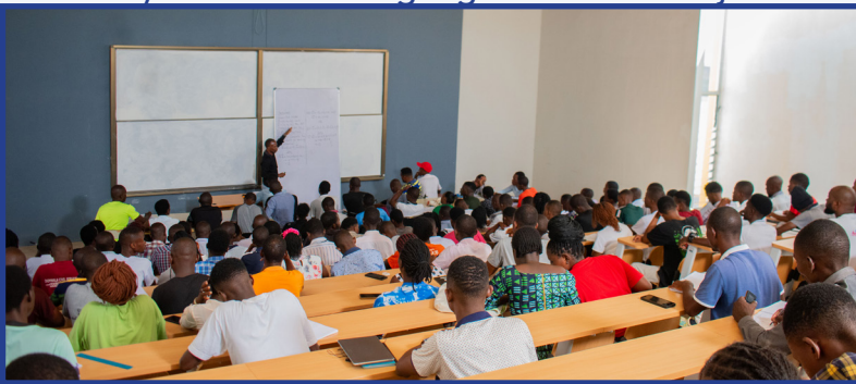
Students learning in one of the lecture halls

Note that all the programmes are for four years. Actual specialization in the field of study starts in third year with an extra research project in the final year.