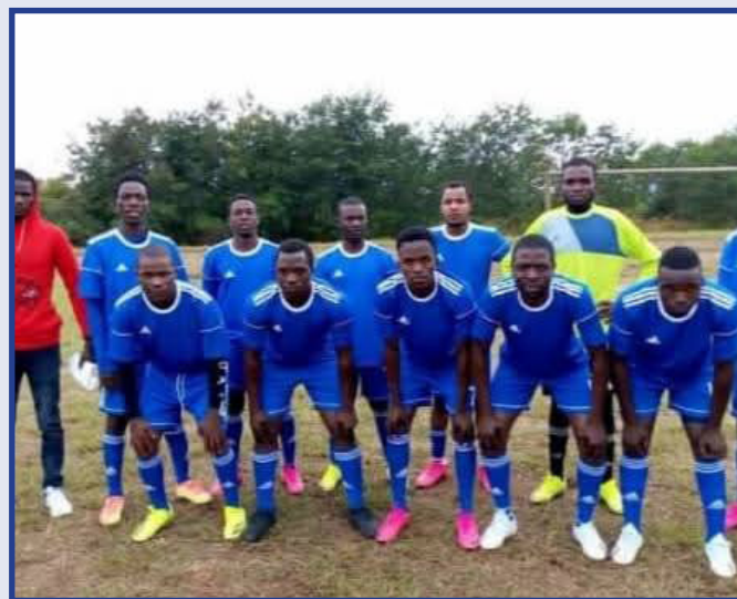
DCE's football team posing before a match

Whether you are an active sports person, or simply interested in physical fitness or just wanting to socialise, DCE has plenty of opportunities for your comfort. DCE football ground is a full size-11-a-side pitch located in a breeze of Domasi River to the east of the main campus. It is a multipurpose pitch since different markings can be made to accommodate a variety of sporting activities. Additionally, the tracks around the pitch are regularly used in competitive athletics. The College has also basketball, netball and volleyball courts. The College has also a gymnasium purposely built to accommodate various games in a covered arena. Such games include, hockey, basketball, netball, volleyball and tennis, among others