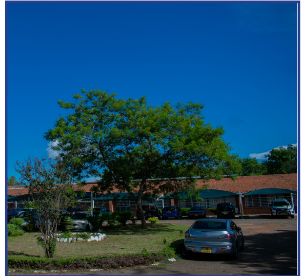
DCE car park and administration blocks

The year 1997 saw several important developments: The two-year diploma course was changed to a three-year programme with intake comprising both serving teachers and school leavers; and diversification of College programmes to include the Department of Social Studies which offered Geography, Theology and Religious Studies and History. To further increase its efficiency, the College introduced three faculties, namely: The Faculties of Science, Education and Humanities. In 1998, the College introduced Physical Education into the programme. In 2000, the College introduced open and distance learning as a mode of delivery with support from Canadian International Development Agency (CIDA) through Secondary School Teacher Education Project (SSTEP). Since then, DCE is a duo mode institution in course delivery. In the year 2008, the College introduced Agriculture Education into its programme with support from African Development Bank. The College also introduced Social Studies as one of the courses offered in the Faculty of Humanities.